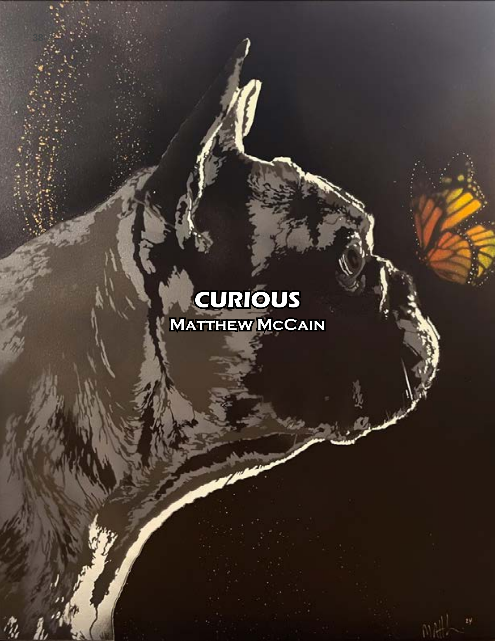
CURIOUS MATTHEW MCCAIN