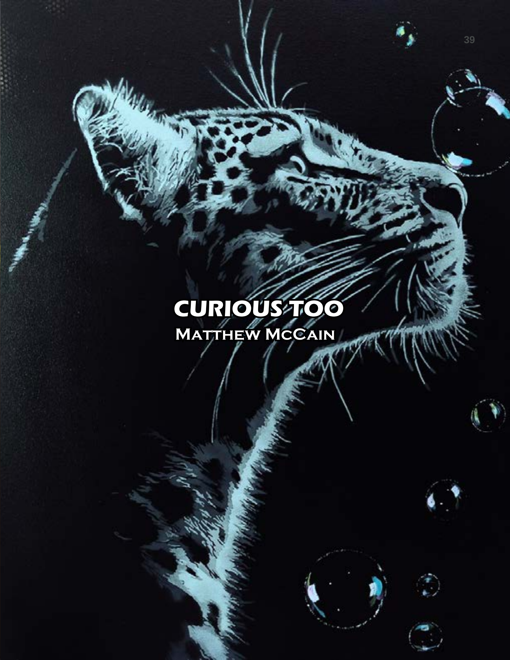
CURIOUS TOO MATTHEW MCCAIN